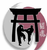
Combined Martial Arts 07 5527 4911 www.c-m-a.com.au

http://www.donateblood.com.au/get-involved/club-red-group-donations/join-club-red-group